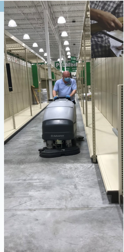
Employment Services Page 2

Community Bridges is picking back up this month and planning some pretty awesome trips! This month, they will be taking groups to the Raptor Center in Yellow Springs. We look forward to some great trips, opportunities and experiences!